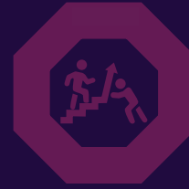
Supportive of Others