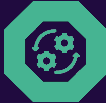
Honesty and Integrity