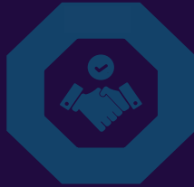
Open to Change

Our values underpin everything we do, including our recruitment, performance and promotion processes. We live by our values which define how we conduct ourselves and our business.